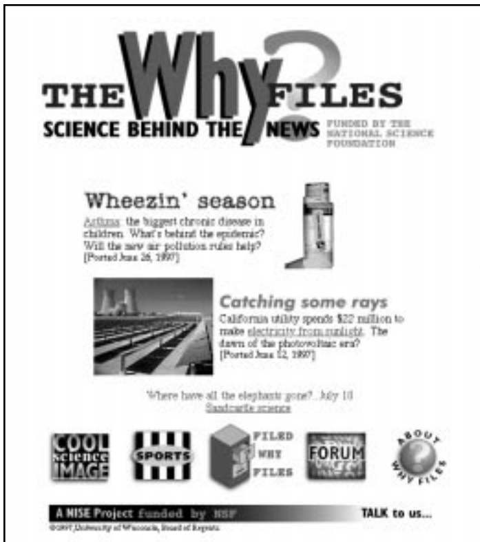
The National Institute for Science Education's Web site, Web page above, is maintained by three part-time specialists.

er languages, with gigabucks riding in the balance.