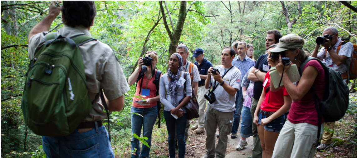
Biodiversity Tour at the SEJ Annual Conference in Chattanooga.